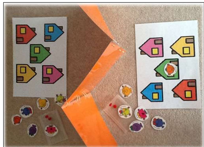
Mr Men visiting coloured houses.