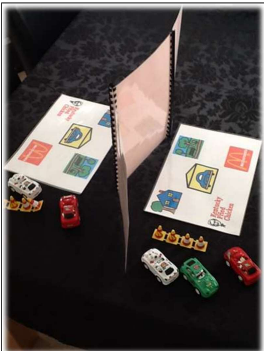
Cars visiting different places.